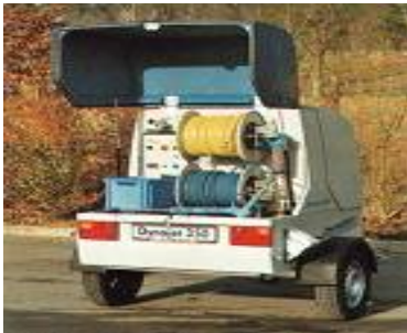
The TARGA design feature gives a practical separation of work area (blue hood) and engine compartment (grey hood)

The Dynajet 350th is constructed on a single axle making it extraordinarily manoeuvrable and easy to position on-site. The Dynajet 350th with its high efficiency, modern design and user-friendliness makes it the high pressure cleaner for the professionals. A fully automated control system monitors all functions of the machine and can switch it off if required. This is also the same for the high performance burner of the APS 350th, which has a flame monitor.