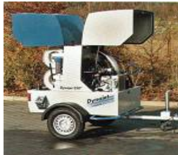
The inside is tidy and well arranged there is ample space for tools and accessories below the lockable hoods