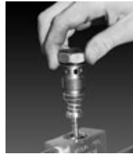
Quick-change cartridge seal