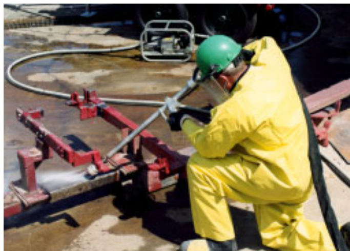
Paint removal for automotive skids using the NLB Model NCG8400A-3 rotating hand lance.