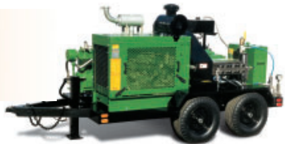
Model 40201D - 6 gpm (23 lpm) at 40,000 psi (2,500 bar)