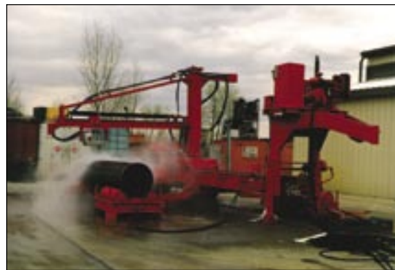
The pressure and flow produced by the NLB 605 Series pumps makes it ideal for use with NLB's shellside cleaners.

All Units Are Factory Tested Before Shipment