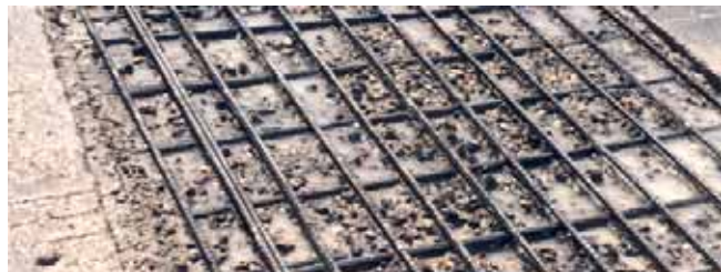
Hydrodemolition leaves rebar free of damage and clean for ideal new overlay bonding.