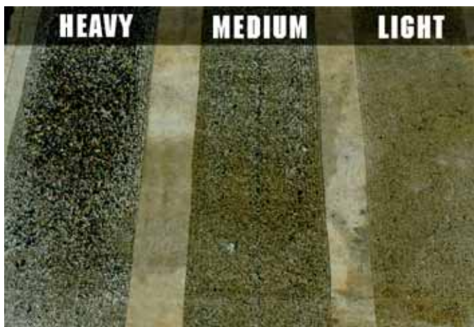
Various levels of concrete scarification

Numerous concrete surfaces are coated with materials to reduce moisture seepage and premature wear. These coatings, commonly called membranes or epoxy coatings, must periodically be removed so the concrete surface can be inspected, repaired, or recoated. The NLB SPIN-JET coating removal system delivers water at pressures of up to 20,000 psi to the surface to remove any stubborn coating.