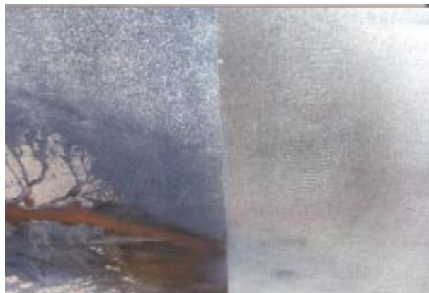
OSB screen before and after cleaning pictured above.